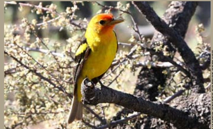
Western Tanager ( Piranga ludoviciana )