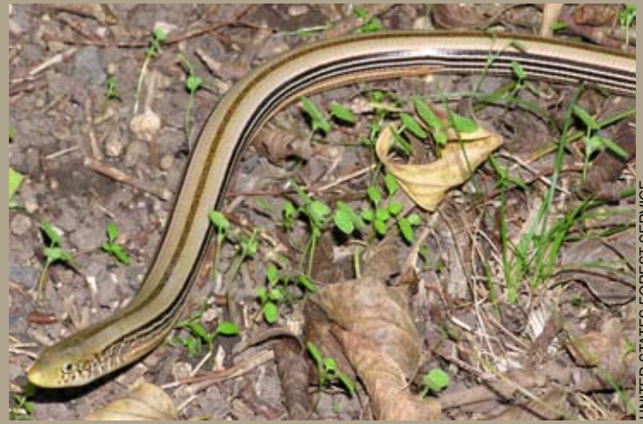
Long glass lizard ( Ophisaurus attenuatus )

Arizona Game and Fish Department (AGFD) Arkansas Game and Fish Commission (AGFC) Association of Fish and Wildlife Agencies (AFWA) Georgia Pacific (GP) Resource Management Services (RMS) South Carolina Department of Natural Resources (SCDNR) Resident Game Bird Working Group, AFWA Partners In Flight (PIF) US Fish and Wildlife Service (USFWS) US Geological Survey (USGS) US Forest Service (USFS) Natural Resources Conservation Service (NRCS) Bureau of Land Management (BLM) Wildlife Management Institute (WMI) National Wild Turkey Federation (NWTf) ESRI Hulsey, McCormick and Wallace, Inc. Alabama State Chapter, NWTf Indiana State Chapter, NWTf Kansas State Chapter, NWTf Maine State Chapter, NWTf Mississippi State Chapter, NWTf Nebraska State Chapter, NWTf North Dakota State Chapter, NWTf New Jersey State Chapter, NWTf New York State Chapter, NWTf Oklahoma State Chapter, NWTf Oregon State Chapter, NWTf Pennsylvania State Chapter, NWTf South Dakota State Chapter, NWTf Wisconsin State Chapter, NWTf