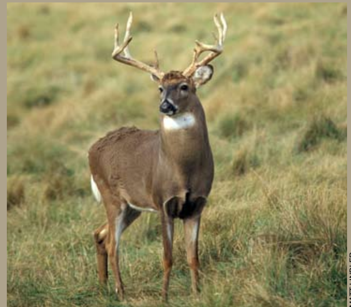
White-tail deer ( Odocoileus virginianus )